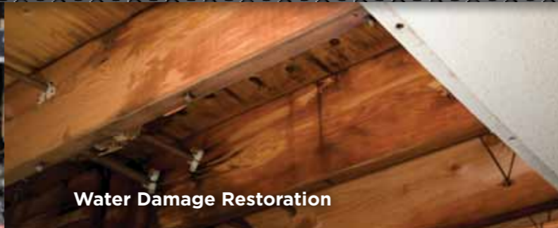
Water Damage Restoration