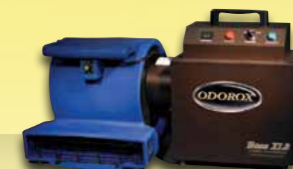
ODOROX® Boss XL3™ Unit with External Blower* *Blower sold separately