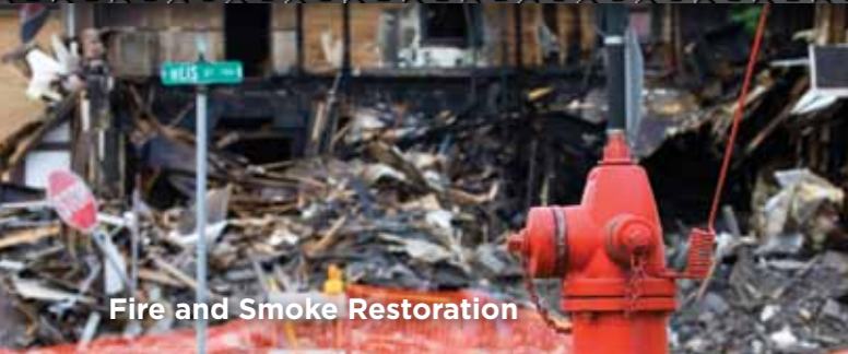
Fire and Smoke Restoration